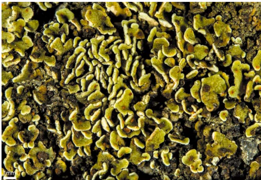
Fig. 3. Psora testacea from the Khibiny Massif